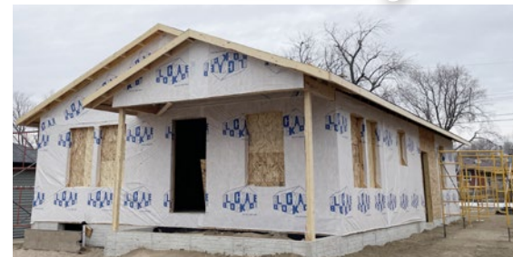
Lincoln Northeast High School students are building a home for a family in need at 1028 Furnas Ave.

be sold to an eligible family involved with LHA. The price hasn't been set, but interested LHA families can determine their eligibility to purchase the house by contacting Susan at SusanT@L-housing.com . Applicants are encouraged to take homeownership preparation classes through NeighborWorks at nwlincoln.org/our-work/homeownership/education.html .