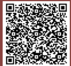
Scan QR code to view current rental listings

Authority. All units must meet Lincoln Housing Authority program requirements, pass rent reasonableness, and meet Housing Quality Standards before assistance may begin.