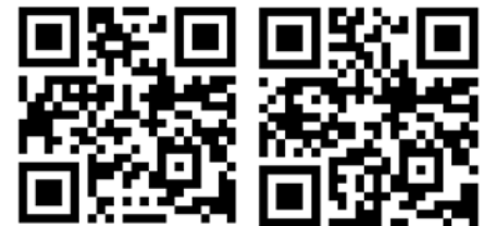
Business/Contractor Registration Worker Registration