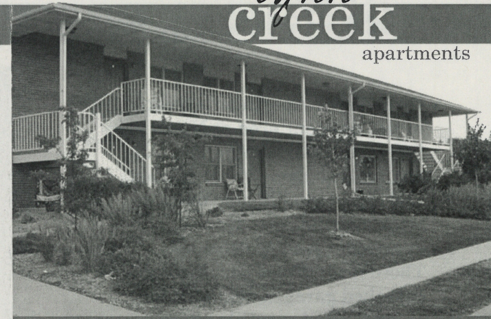
920 & 930 Garber Avenue